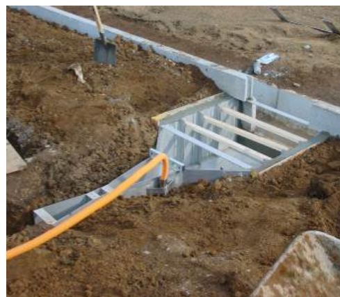
Photo 3.8-3 An example of installation of a Parshall flume for the measurement of the flow rate of an open channel flow.