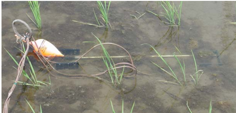
Photo 3.8-1 Use of a float in measurement of paddy water temperature. (Mase paddy flux site)

To measure water temperature at a constant water depth below the water surface, the sensor is hung from a float. To make measurements at a constant water depth above the water bottom, a weighted sensor is suspended in the water with a float. In either case, the float and the sensor should be covered entirely with a tubular net to prevent wind and current from carrying away the device. Also, caution should be exercised to keep the sensing unit from touching the net.